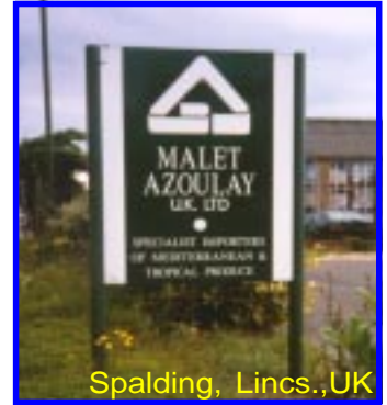
Spalding, Lincs., UK

The stored energy over off-peak / low load periods is later utilised to satisfy the short & sharp peak loads. Hence, the installed refrigeration machinery is 1/10 of an equivalent capacity of a conventional direct cooling system.