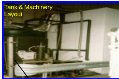
Tank & Machinery Layout