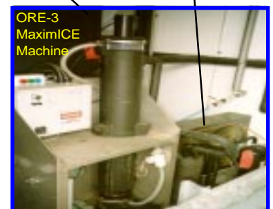
ORE-3 MaximICE Machine

Any future capacity or change of operational patterns can be easily handled without the need for additional refrigeration machinery.