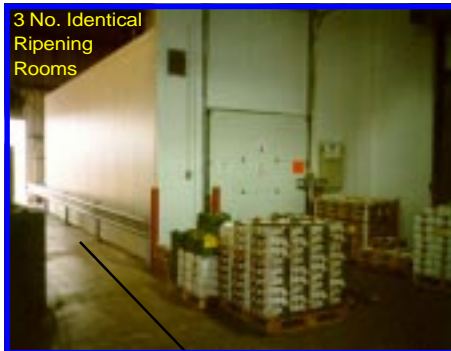
3 No. Identical Ripening Rooms

Warm & humid ripening periods terminated by a rapid cooling process whereby the energy stored during ripening periods is recovered by circulating solution within the air spray heat exchanger in order to provide 0 ~ 1 C air off temperatures during the rapid cooling periods.